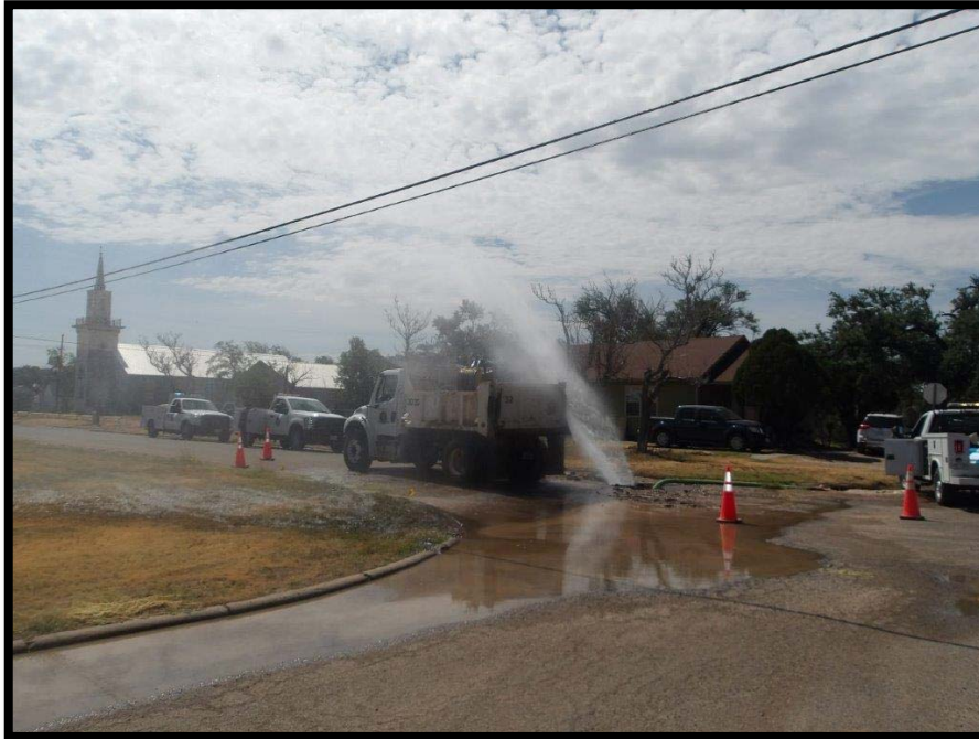
Water Leak—4th & Cedar